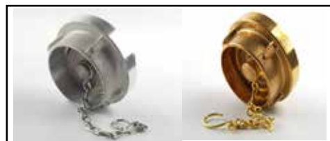
Model No.: RK - CPL - 104