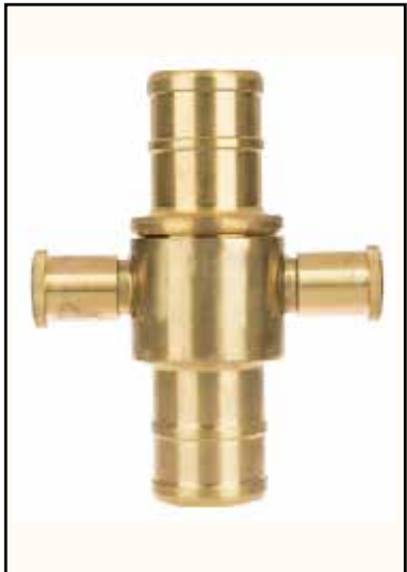
Model No.: RK - CPL - 201