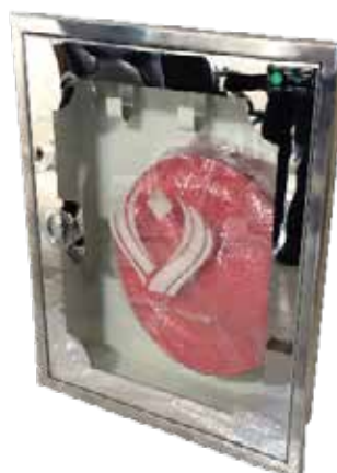
Model No.: RK - HRC - 108