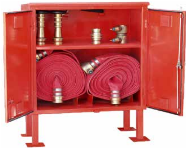
Model No.: RK - HBC - 101