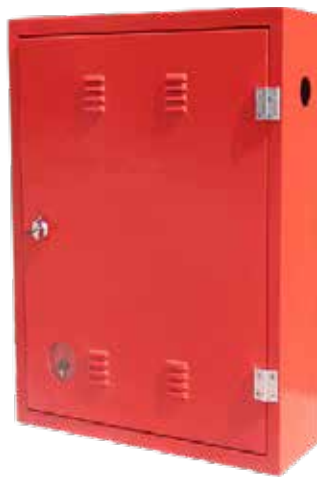
Model No.: RK - HRC - 101

The door design has some options: standard, red blind, white blind, white semi-blind, totally stainless and etc.