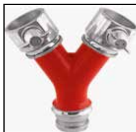
Model No.: RK - DVD - 201