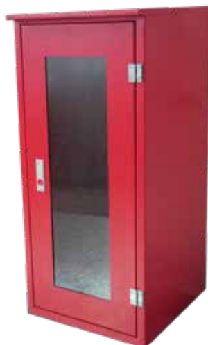
Model No.: RK - EC - 102