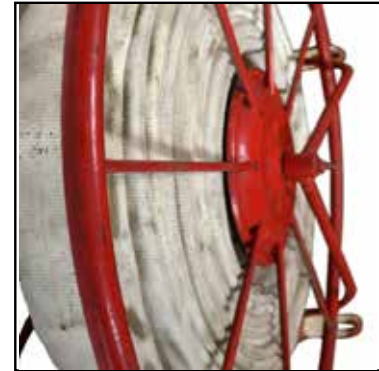
Model No.: RK - HR - 201