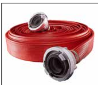
Model No.: RK - FH - 102