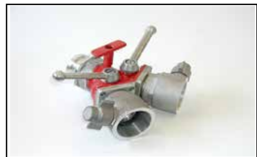
Model No.: RK - DVD - 301