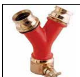
Model No.: RK - BRCH - 201