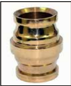
Model: RK - CPL - 203