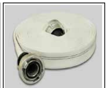
Model No.: RK - FH - 104