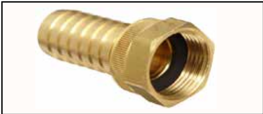
Model No.: RK - CPL - 205