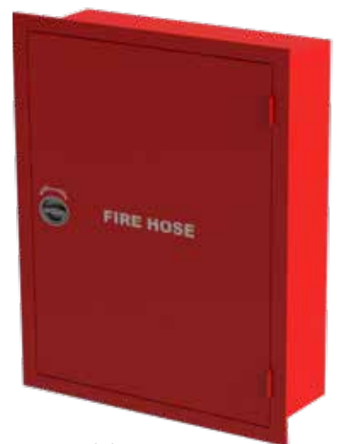
Model No.: RK - HRC - 102