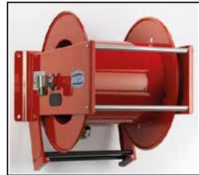
Model No.: RK - HR - 301