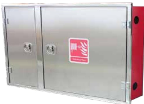
Model No.: RK - REC - 201