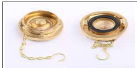
Model No.: RK - CPL - 103