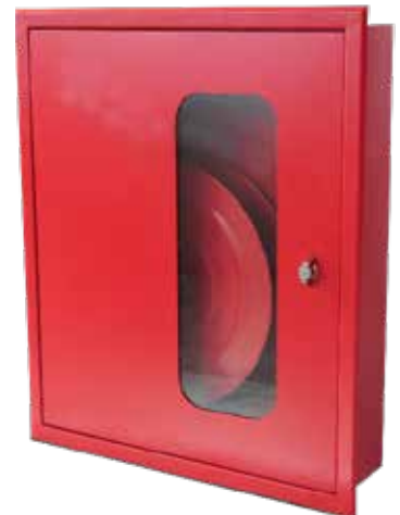
Model No.: RK - HRC - 104