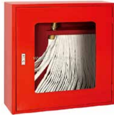
Model No.: RK - HRC - 301

The fire hose cabinet can be made with blind door, stainless steel blind door and semiblind door.