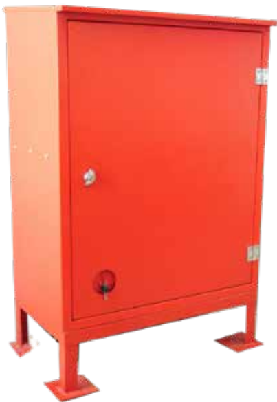
Model No.: RK - HRC - 201