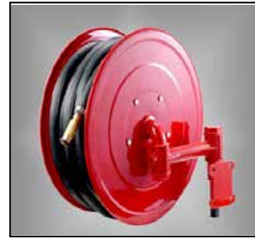
Model No.: RK - HR - 101

for use in office buildings, schools, hospitals, kindergartens, sports arenas, cinemas, hotels and conference centres, airports and shopping centres.