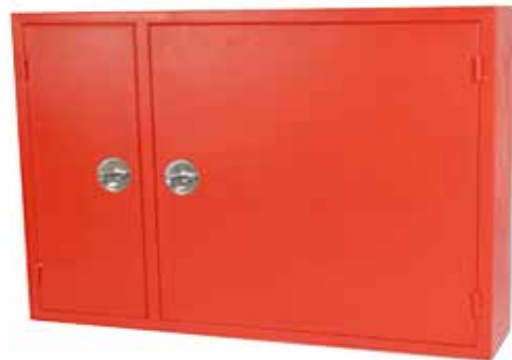
Model No.: RK - REC - 202