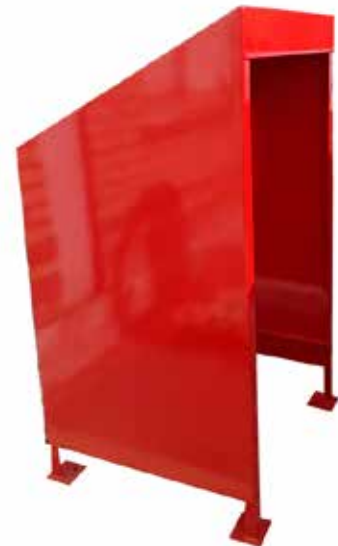
Model No.: RK - EC - 201

Cabinets doors are available with options of full metal, full glass frame, center break glass and wired glass door to meet requirements. Instruction sign in English are silkscreen printed on the cabinet.