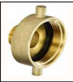
Model: RK - CPL - 204