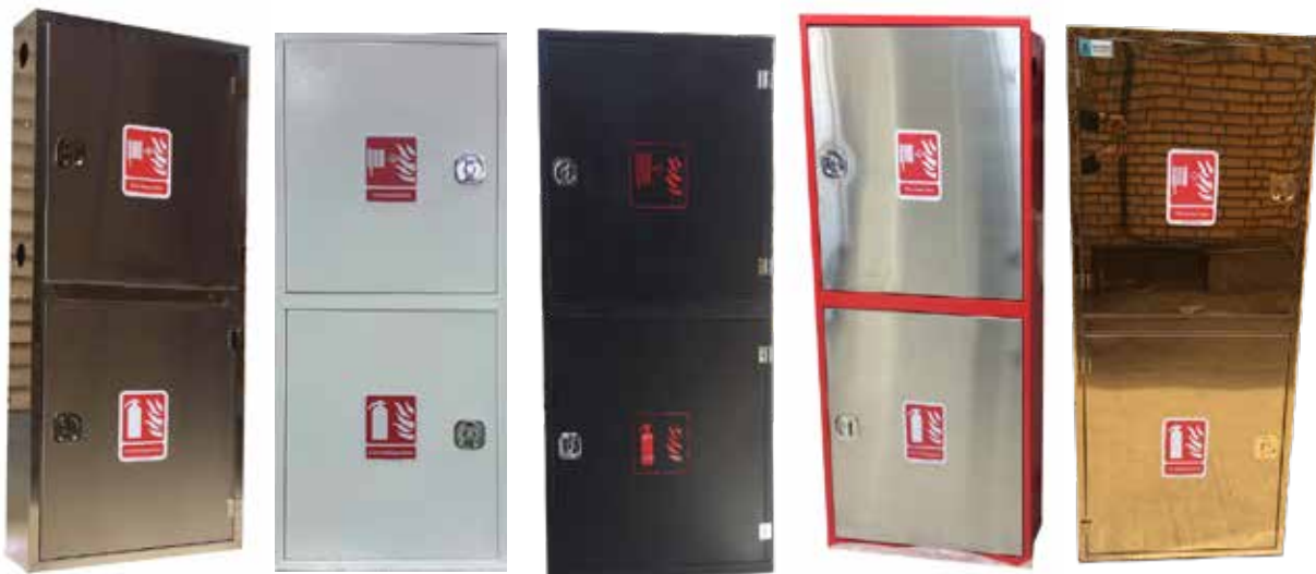
RK - REC - 101

+98 21 8852 3248 +98 21 8852 3249 info@arkasanat.com www.arkasanat.com