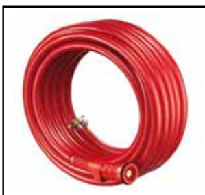
Model No.: RK - FH - 101