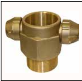
Model: RK - CPL - 202