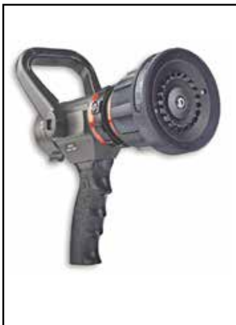
Model No.: RK - NZ - 101

Branch pipes and nozzles are commonly used for range of wash down and jet spray applications and can be connected to standard hose or layflat fire hose using instantaneous fire hose couplings. The following are our most common types.