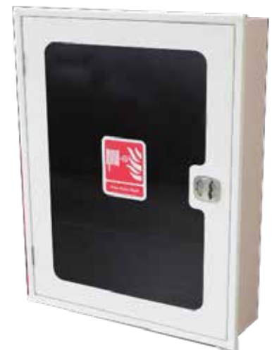
Model No.: RK - HRC - 106