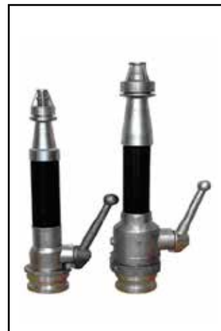
Model No.: RK - NZ - 401