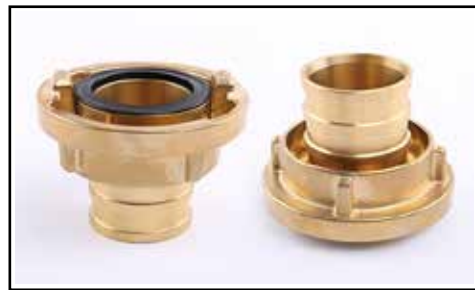
Model No.: RK - CPL - 101