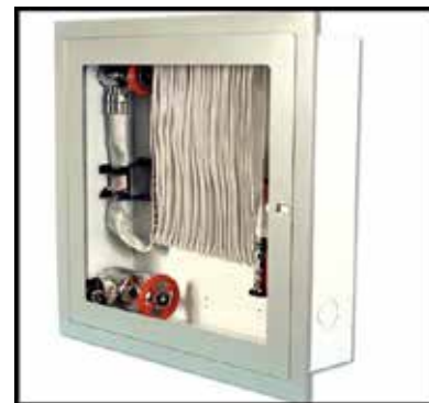
Model No.: RK - HRC - 302