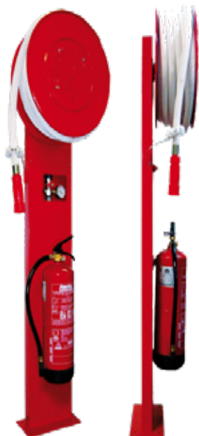
Model No.: RK - HRC - 401