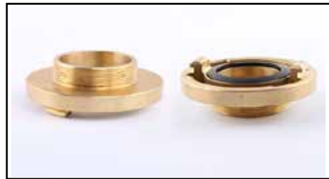
Model No.: RK - CPL - 102