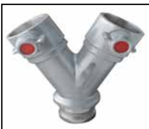
Model No.: RK - DVD - 101

Designed to allow multiple hose lines to be connected to a single hose the breechings are available with British or International adaptors for compatibility to existing equipment.