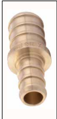
Model: RK - CPL - 207