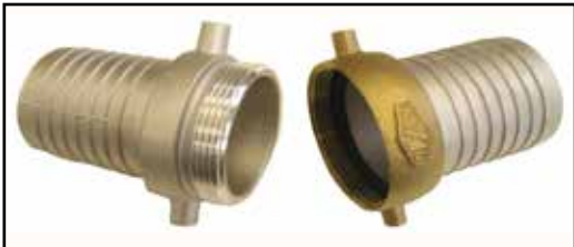
Model No.: RK - CPL - 206