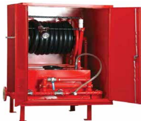
Model No.: RK - HRC - 402