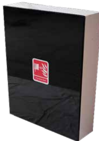
Model No.: RK - HRC - 109