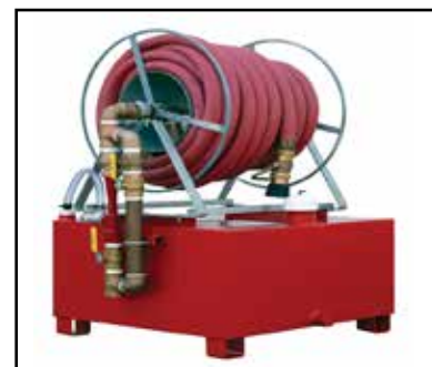
Model No.: RK - HR - 303