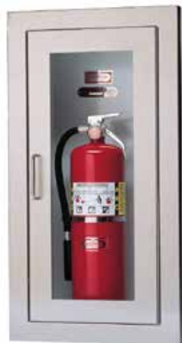
Model No.: RK - EC - 103

Cabinets doors are available with options of full metal, full glass frame, center break glass and wired glass door to meet requirements. Instruction sign in English are silkscreen printed on the cabinet.