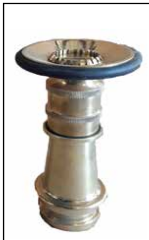
Model No.: RK - NZ - 201