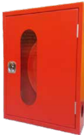
Model No.: RK - HRC - 103