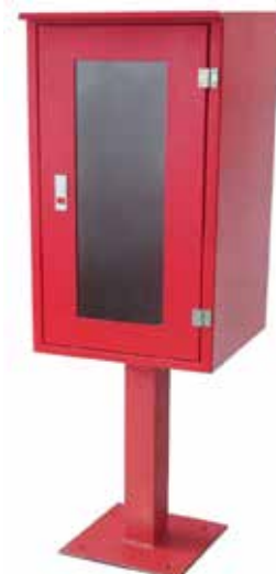
Model No.: RK - EC - 101