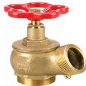
Model No.: RK - LNV - 101 Material: COPPER alloy (Brass)