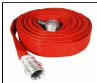
Model No.: RK - FH - 103