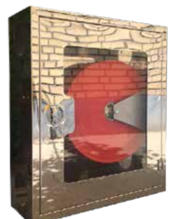
Model No.: RK - HRC - 107