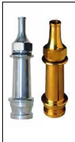
Model No.: RK - NZ - 301