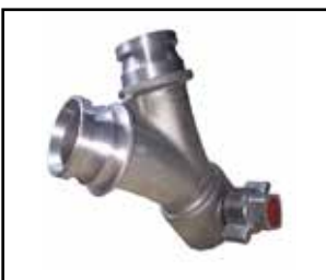
Model No.: RK - BRCH - 101