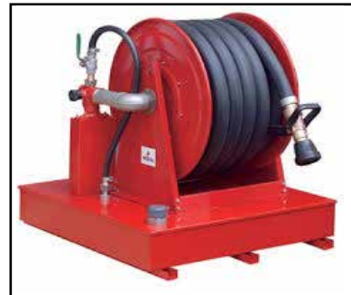
Model No.: RK - HR - 302