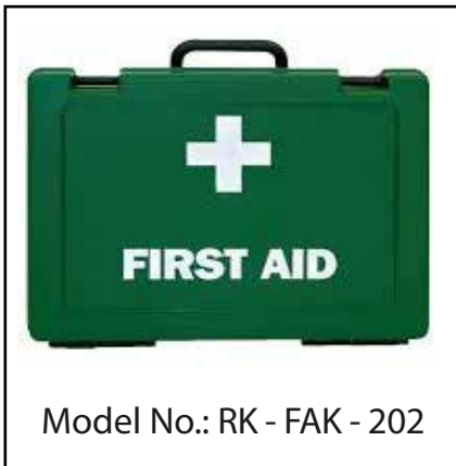
Model No.: RK - FAK - 202

First Aid Kit made from a rubber-like material. The equipment is kept hygienically clean and is always ready to be used