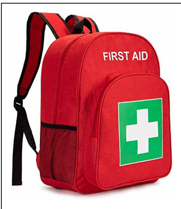
Model No.: RK - FAK - 301