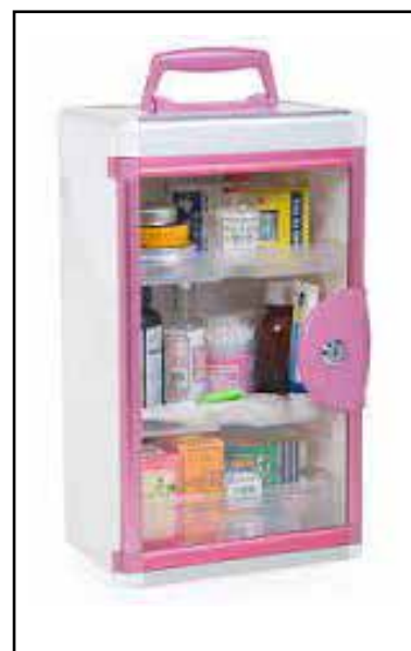
Model No.: RK - FAK - 101