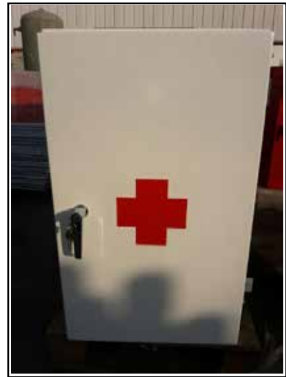
Model No.: RK - FAK - 401

If you are looking for a comprehensive industrial first aid box for your workplace, then look no further. This commercial first aid kit is specifically designed for industrial use, meeting the needs of workplaces throughout Australia such as food service industries where durable plastic cabinets are required, Containing an extensive range of first aid industrial medical supplies, this commercial first aid kit has everything you need to keep your workplace prepared for an emergency situation, This Commercial Kit is a large industrial first aid kit with all the medical supplies you need to keep your organisation safety compliant. See below for details of the industrial first aid supplies included.