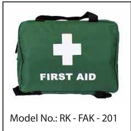
Model No.: RK - FAK - 201